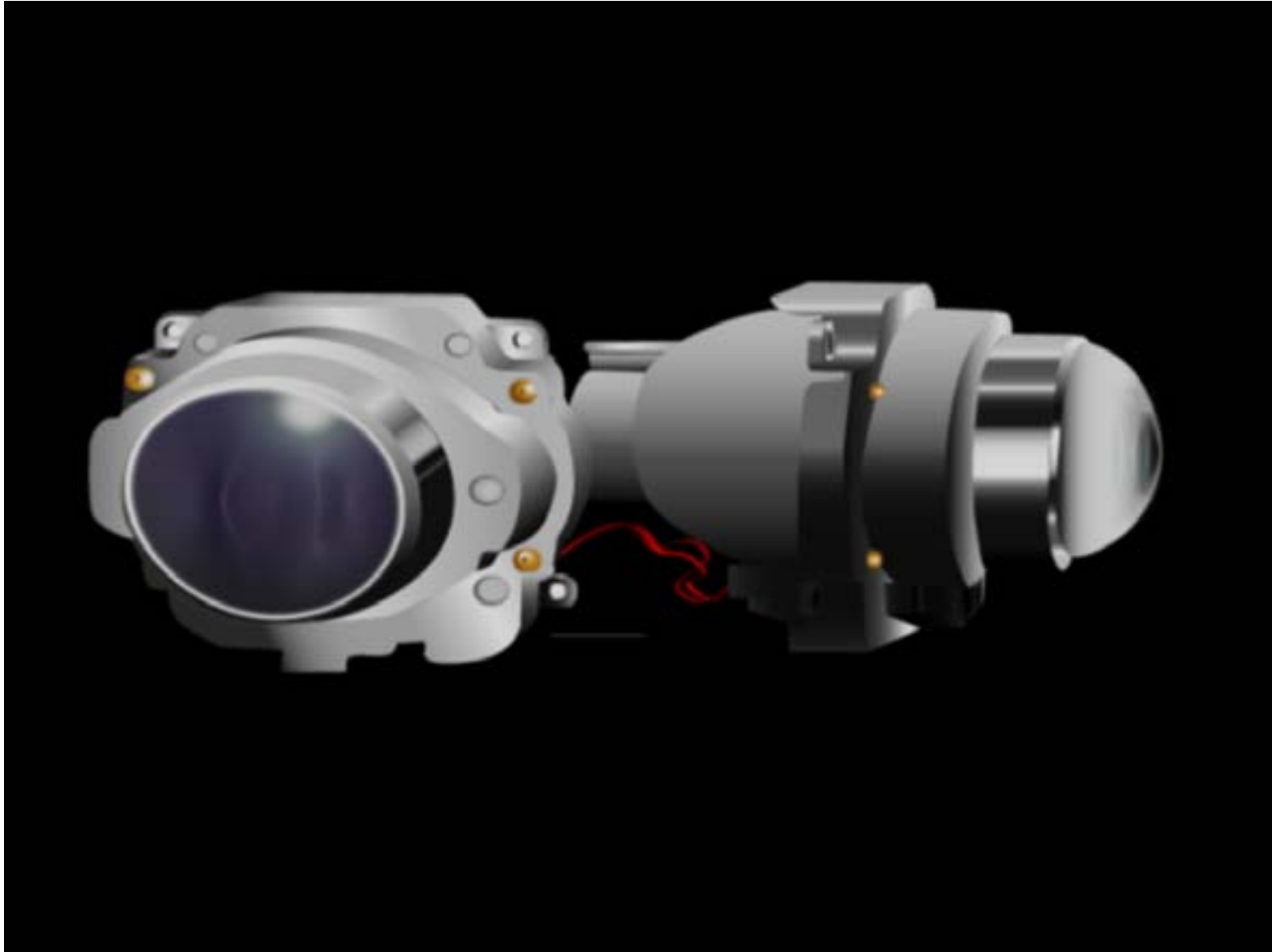
Art transitions from hand to digital. (Created in VC220 using Adobe Illustrator)