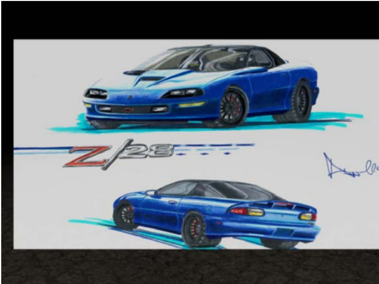
Art flies towards camera and fades out. (Hand drawn in CD130 - Rapid Visualization)