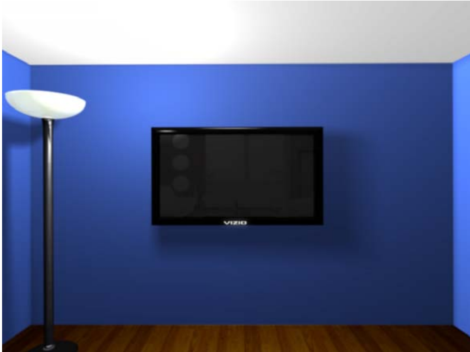
Zoom toward television. Screen lights up and begins playing video. All modeling work done using Autodesk 3DS Max.