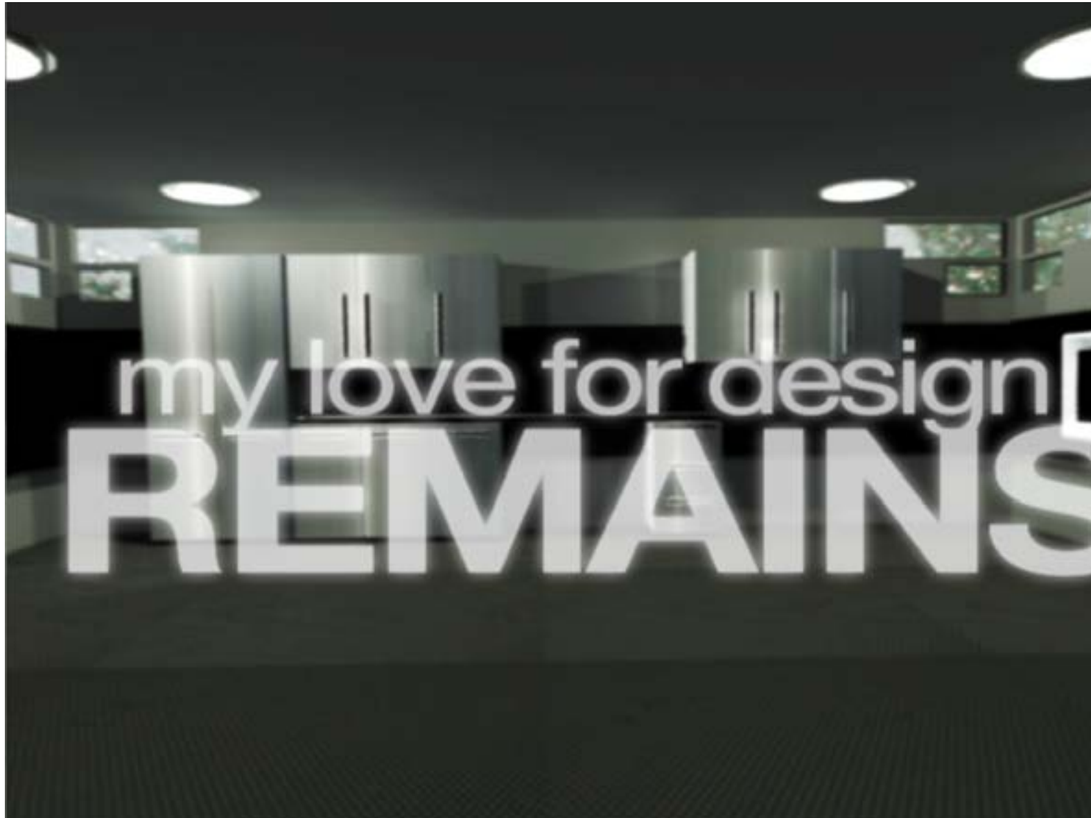
Final piece created using Autodesk 3DS Max (IT311) as text, "my love for design remains", fades in and out (Adobe After Effect IT212).