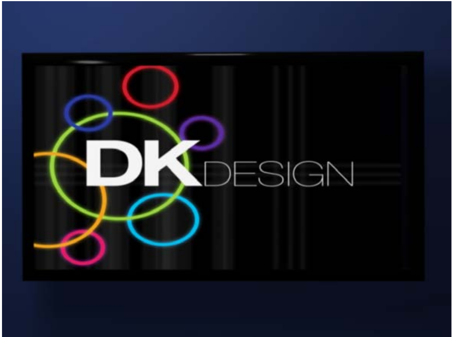
Camera pans back outside of the television screen displaying the student's personal brand.