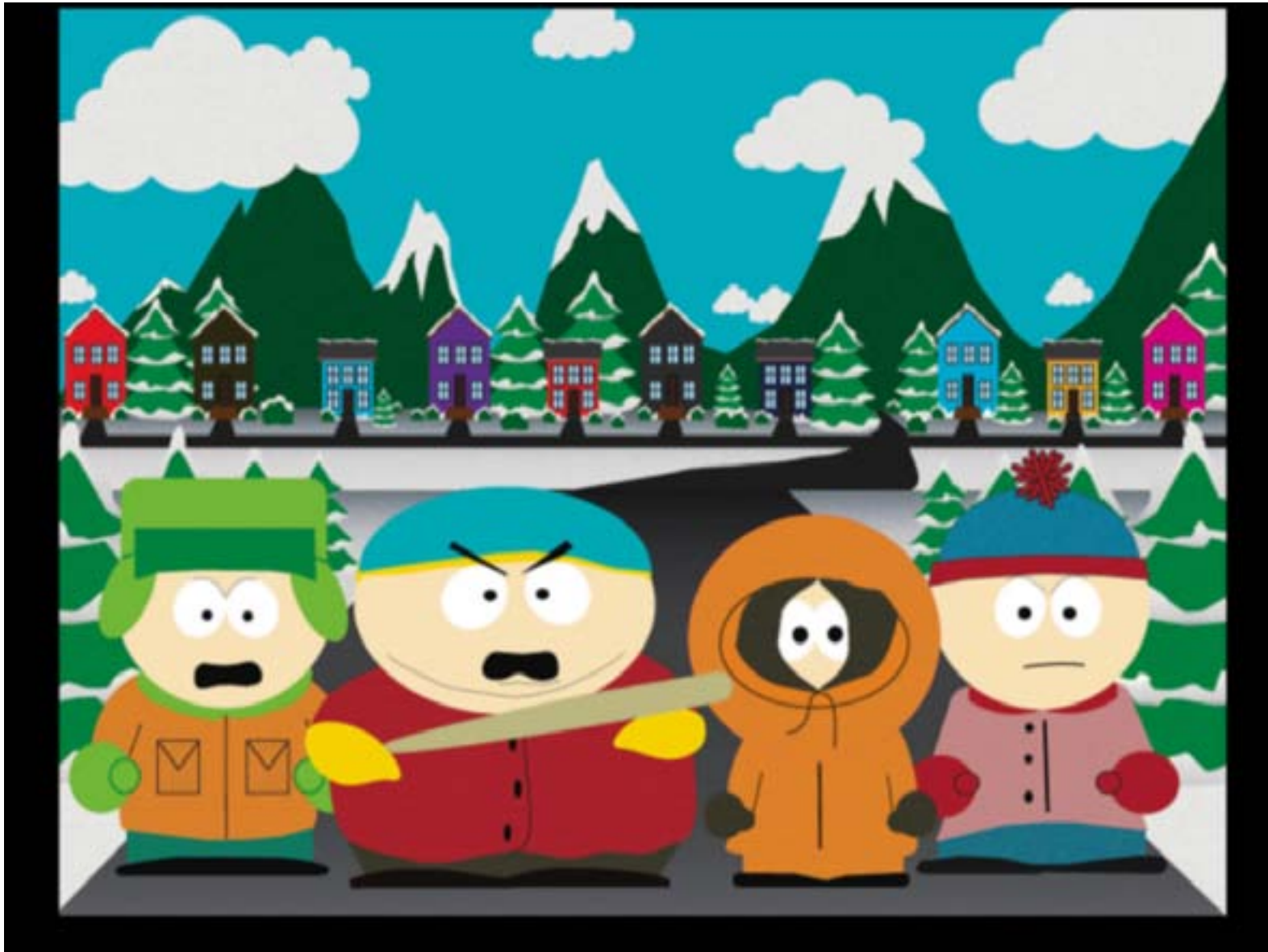
Art transitions from hand to digital. (Created in VC220 using Adobe Illustrator)