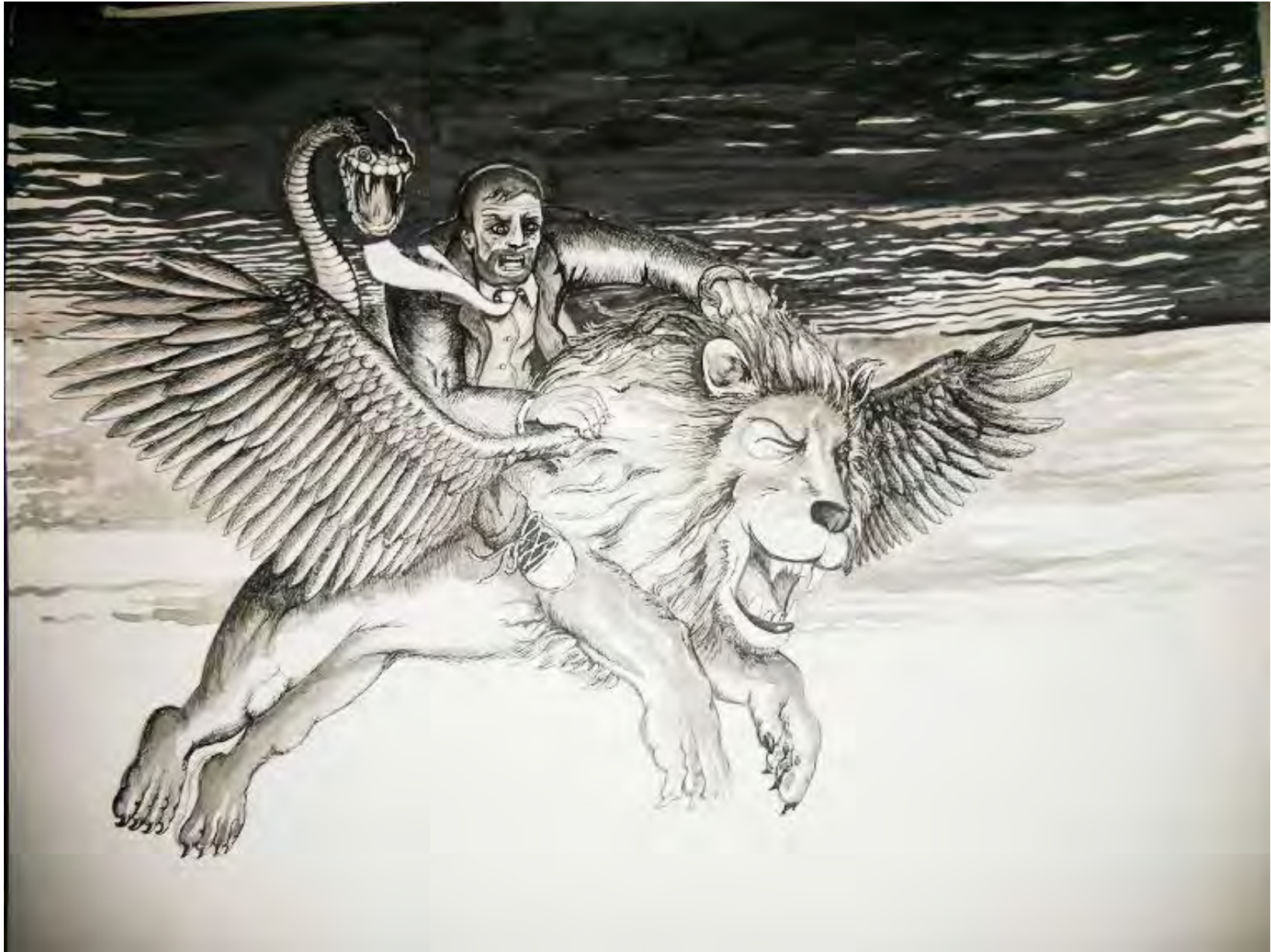
The black and white art was done using both a pen and a #1 synthetic sable brush and Higgin's Black Magic ink on 17" x 14" Bristol board.