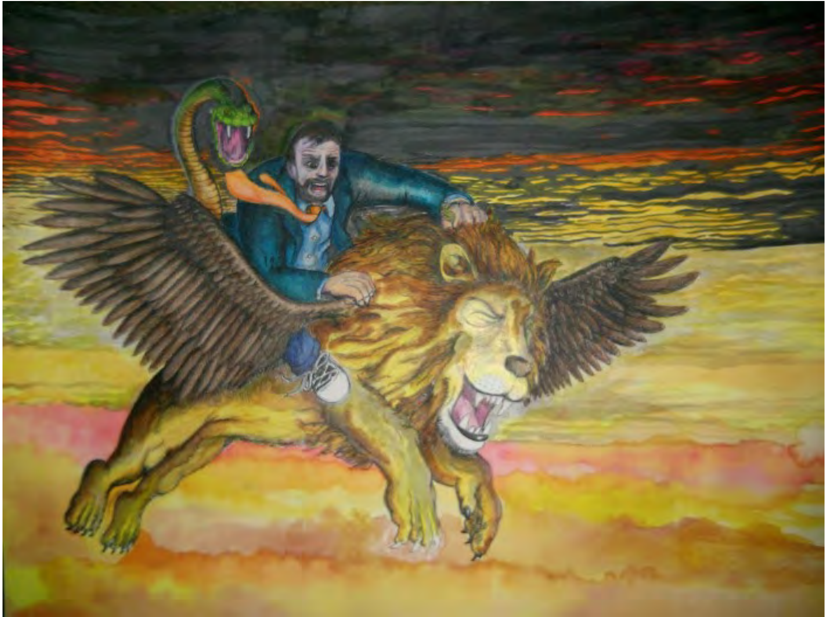
The final color was done using both watercolor pencils and paint.